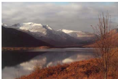
Along the road to Skye

The RRF 2009 annual conference will be held overseas for the first time, to reflect the global interests of its membership. Hosted by the Scottish Raptor Study Group, this event will be held in an exclusive hotel in the small town of Pitlochry, central Scotland, with a full program of scientific presentations, workshops and seminars. Social events include the hire of a nearby castle