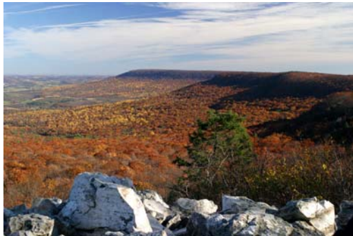
View from Hawk Mountain

with this event with many of the premier regional wildlife artists are exhibiting and selling raptor art. Robert Bateman has contributed a Red-tailed Hawk print.