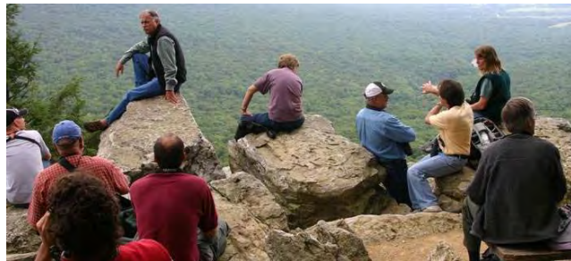
Conference participants at South.