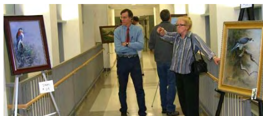
Raptor art show at the Muhlenberg College Science Center.