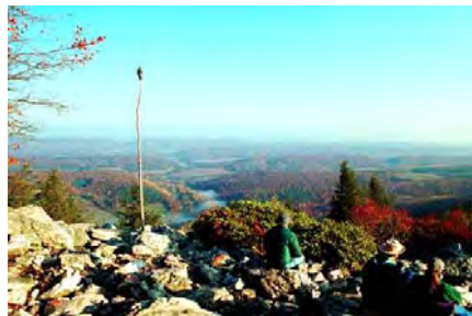
Looking North from Hawk Mountain (North Lookout with owl decoy HMS collection)