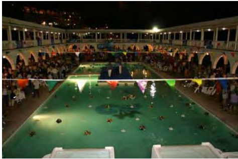
Welcome social at 2006 NAOC