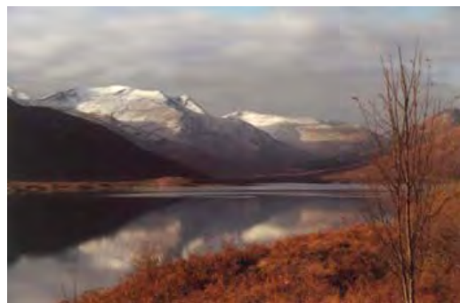
Along the road to Skye

The RRF 2009 annual conference will be held overseas for the first time, to reflect the global interests of its membership. Hosted by the Scottish Raptor Study Group, this event will be held in an exclusive hotel in the small town of Pitlochry, central Scotland, with a full program of scientific presentations, workshops and seminars. Social events include the hire of a nearby castle