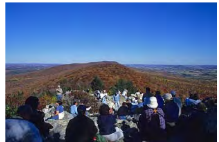
Visitors at North Lookout, Hawk Mountain (NLO on clear day)