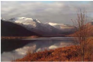
Along the road to Skye

The RRF 2009 annual conference will be held overseas for the first time, to reflect the global interests of its membership. Hosted by the Scottish Raptor Study Group, this event will be held in an exclusive hotel in the small town of Pitlochry, central Scotland, with a full program of scientific presentations, workshops and seminars. Social events include the hire of a nearby castle