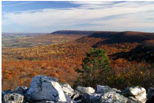
View from Hawk Mountain

with this event with many of the premier regional wildlife artists are exhibiting and selling raptor art. Robert Bateman has contributed a Red-tailed Hawk print.