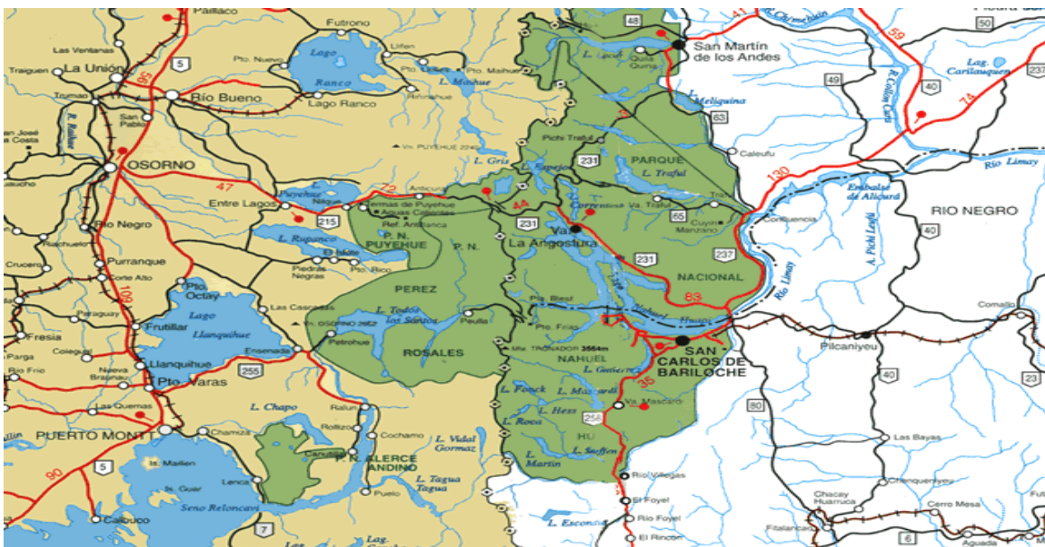
Map of Bariloche and surrounding areas